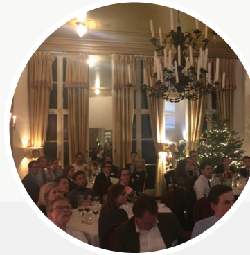
Hydraulic Dinner 1

As the academic year is coming to an end, we can look back on an amazing Hydraulic year, with a lot of amazing Hydraulic activities organized by "Het Waterbouwdispuut". Below we have listed the most remarkable moments of the past year in a timeline for you (and us) to reminisce on the best year yet!